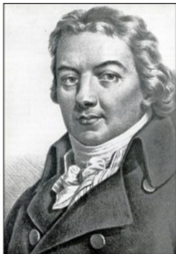
Dr Edward Jenner.