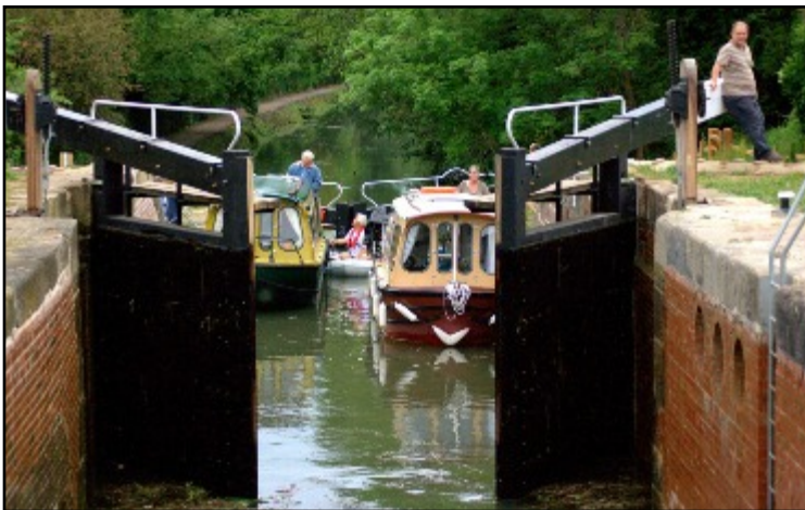
Boats passing through the restored Ryeford Double Lock on their way from Stonehouse to the Jubilee celebrations at Marling School Field, June 2012.