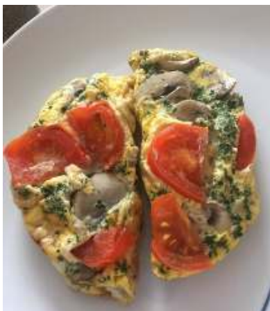
Omelette for lunch filling and tasty