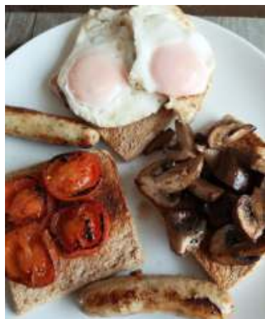
Breakfast - Slimming World English Style

Another Spring is springing and we've had a fantastic couple of months at Groups. Free food February was a brilliant month of sharing all the wonderful foods we can eat while following our Slimming World Extra Easy plan and the Groups members lost an amazing 44 stones over the month. So what can you eat - here's a selection of yummy foods my members enjoy while still losing weight.