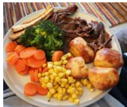
Slimming World Roast dinner - delicious

We've continued to talk about Body Magic our activity programme and many have tried and enjoyed new activity ideas which has been great to hear and learn about. So we continue to move through the year supporting each other to reach our weight loss goals and celebrating Target weights achieved.